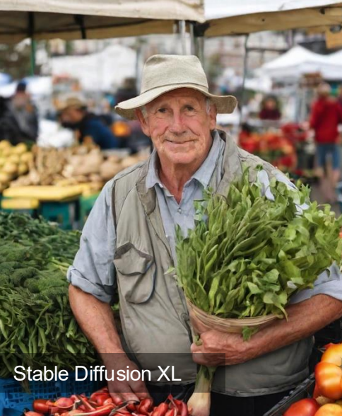
Stable Diffusion XL