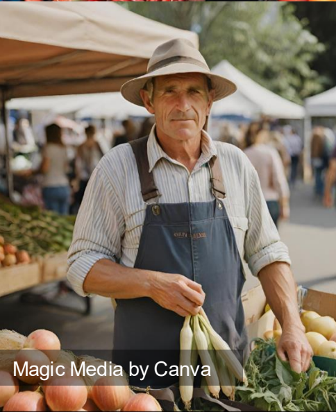
Magic Media by Canva