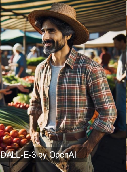
DALL-E-3 by OpenAI